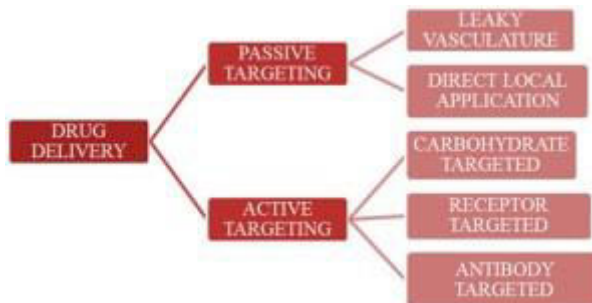
FIGURE 1: TYPES OF DRUG DELIVERY

Such a definition implies that there are a vast number of members in this group. Many of them may not even be feasible, while many others may not be relevant. So, the set of most relevant new drug delivery systems is deduced as follows: